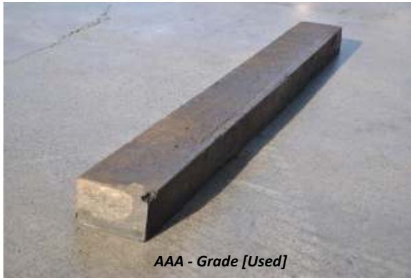
AAA - Grade [Used]