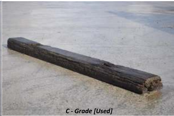
C - Grade [Used]